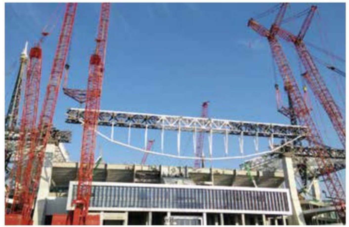
Four-crane lift using custom-designed lift frames.

two 350-foot outer end zone box trusses into four enormous lifts. Two custom-designed lifting frames, each weighing only 35,000 pounds but capable of safely lifting 350 tons, ensured loads were equally shared by the four massive cranes used to perform each lift. The erection scheme also utilized the locked coil steel cables, ranging in size from 3½ to 5 inches in diameter, for support of portions of the canopy structure during construction. Careful analysis was necessary to determine the erected geometry and to control construction loads in the structural members. During erection, portions of the structure were temporarily suspended in place by mobile cranes while the cables were attached in midair. The canopy assemblies were installed in a super-elevated position, allowing the canopy weight to tension the cables and deflect the canopy into its final location. The cable tensioning system was designed to provide up to 1,200,000 pounds of pretension in case the cables required re-tensioning after most of the canopy load was in place. The erection sequence was specifically designed to limit most cables to a single tensioning action; however, for some cables, a two-stage tensioning process was required to maintain geometric alignment and prevent undesired dead loads in certain members. During the second tensioning, the sideline cables were loaded to 924,000 pounds tension.