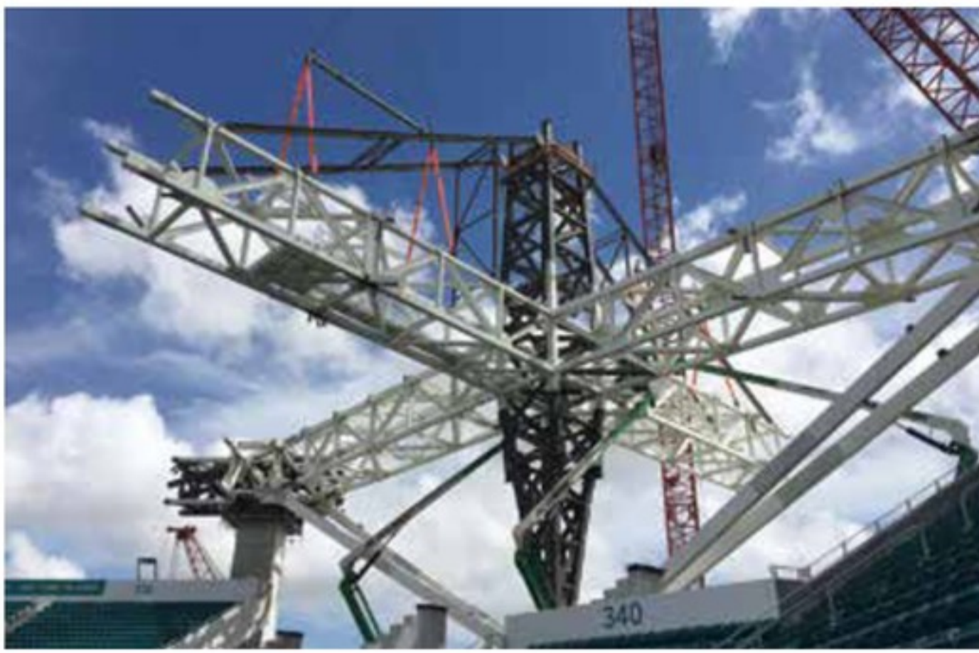
Temporary tendons support balanced cantilevers.