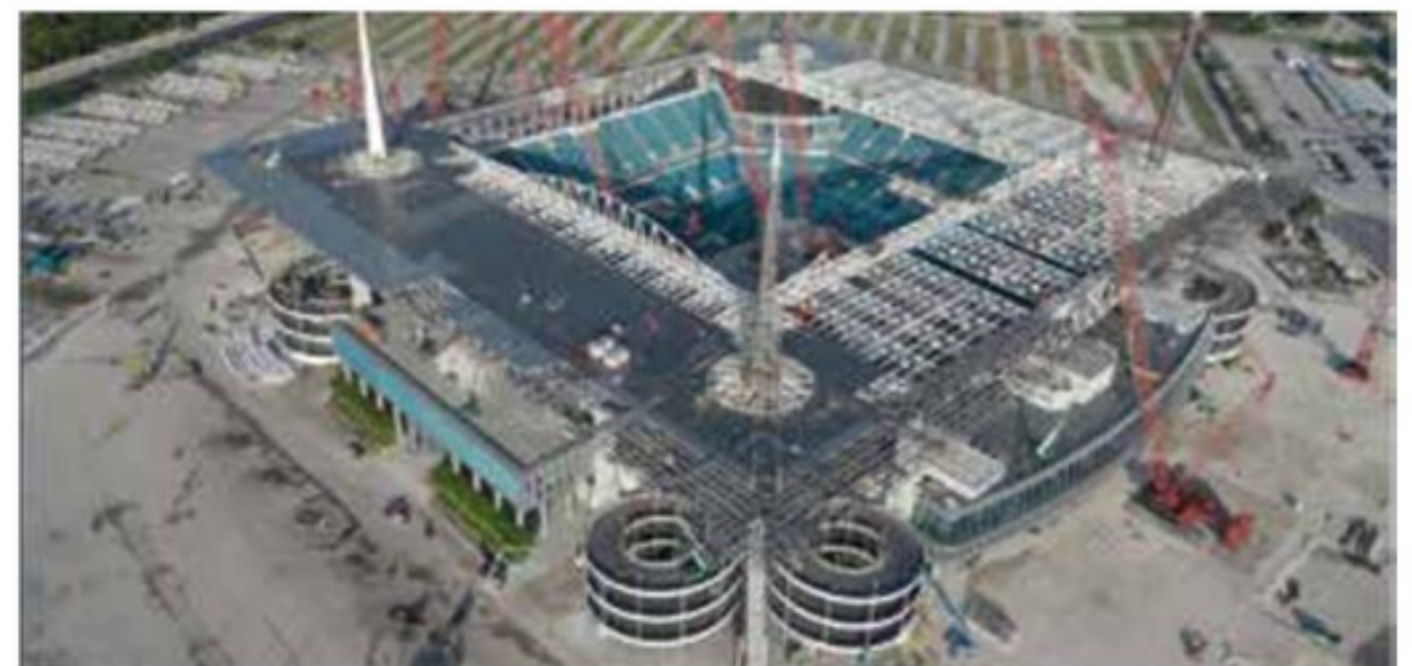
Seven cranes were used to erect the canopy.