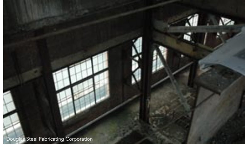
Douglas Steel Fabricating Corporation

▲ Connection design often was complicated by the close proximity of existing steel and connections. Note the slotted holes in the shear plate attached to the column web. To see more photos of this project, visit www.modernsteel.com/photos .