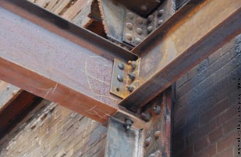
Douglas Steel Fabricating Corporation

▲ In this connection carefully removed rivets were replaced by bolts as part of the new connection. Also note the slotted hole in the beam seat.