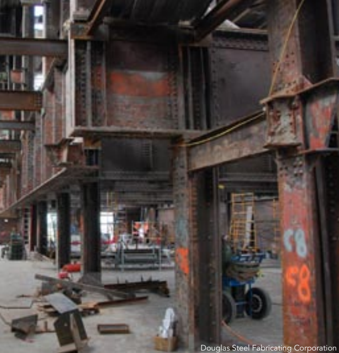
Douglas Steel Fabricating Corporation

▲ Due to the introduction of new loading, many of the original built-up columns and plate girders required special evaluation during the connection design to account for varying material grades and composite sections.