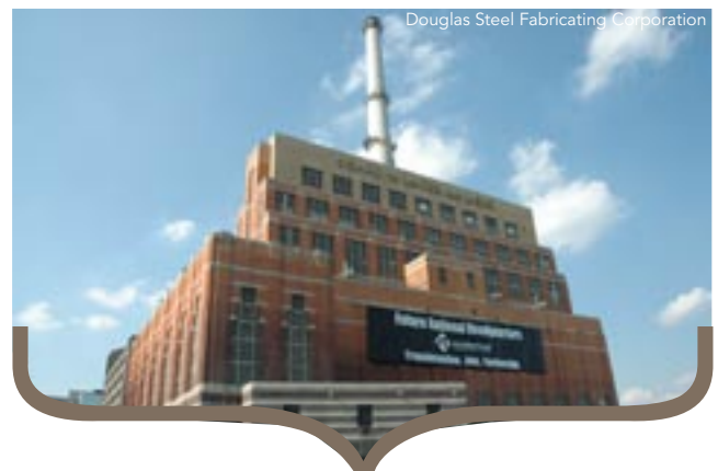
Douglas Steel Fabricating Corporation

▼ The adaptive reuse of Lansing's 1939-vintage Ottawa Street Power Station through a $182 million rehabilitation is reclaiming one of the city's most beloved landmarks.