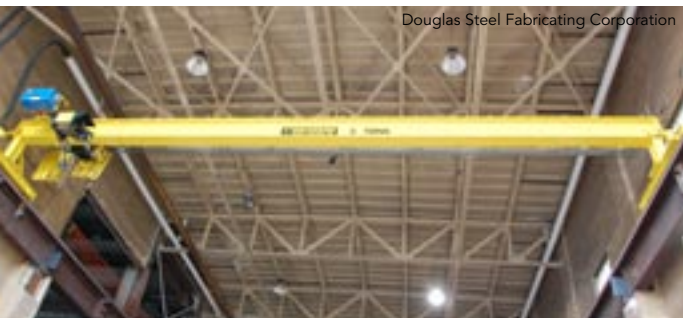
Douglas Steel Fabricating Corporation

▲ Due to the introduction of new loading, many of the original built-up columns and plate girders required special evaluation during the connection design to account for varying material grades and composite sections.