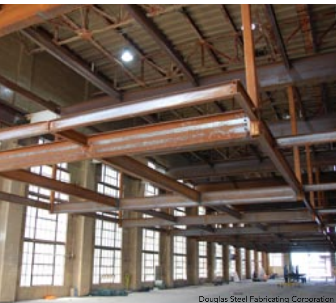
Douglas Steel Fabricating Corporation

▲ To maneuver the steel in the turbine hall, the fabricator/erector installed a new crane for the duration of the project which allowed the use of the existing crane way.